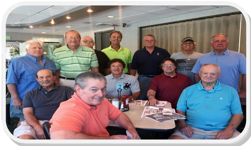
"Team Photo" of last year's attendees

(HamFam), 2027 Hamilton Street, Allentown, PA 18104. Everyone will be on their own for lunch. To confirm your reservation, call restaurant owner Abe Youwakim at: 484/866-3355.