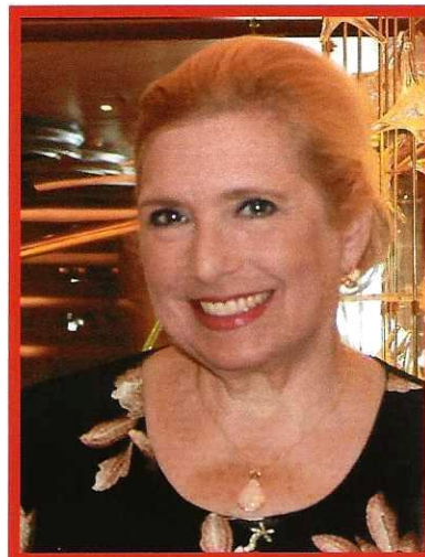
President Alumni Association

Please know that we welcome anyone who would like to volunteer to help during this popular event. We appreciate the support.