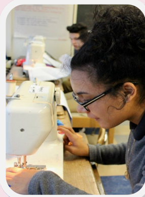
Dieruff students working the sewing machines making various items from teddy bears, to sleeping bags to ponchos

During their weekly after-school gatherings, the students creatively sew those 4'x4' pieces of waterproof material into tarps, sleeping bags, ponchos, and backpacks. A representative of the LVHN then distributes the completed projects directly to the appreciative homeless.