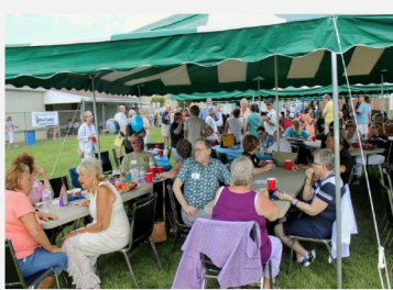
Over 300 Alumni Attended this year's Fandangle

Please be sure to visit the photo galleries found on our website www.dieruff-alumni.org . From our home page, click on the link (along the left column) titled Fandangle 2015 to view over 300 photos taken at the event. What began a few years ago as a casual idea among a gathering of Dieruff faithful grew to be the birth of an annual tradition. All Dieruff alumni are invited to join us again next year on Saturday, July 30, 2016 for our All-Classes Reunion. Mark your calendars now and come to celebrate your Husky Pride!