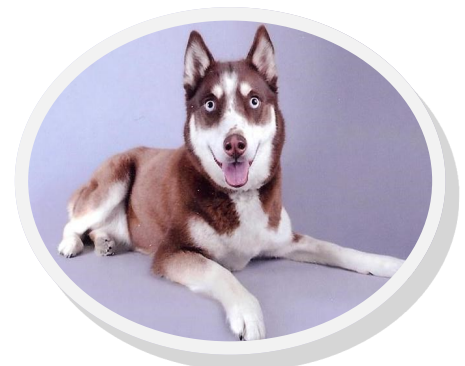
Kiska V Diva Dog