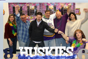
7th Annual Mardi Gras Party