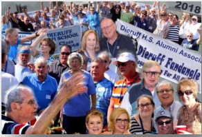
6th Annual Fandangle