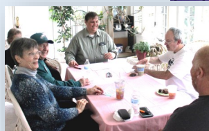
Soup Bowl Sunday