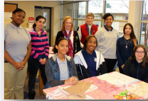
Sew What Club