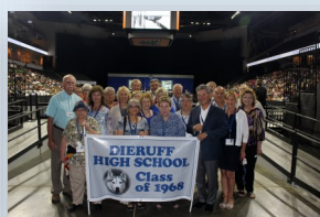
Commencement Led by the Class of 1968