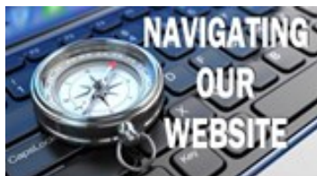
Kay Kurtz Vogel '74

3. Train a Class representative to serve as administrator of your class information on our all-year alumni website – no need to have multiple databases. Our 22,000 plus database is backed up every evening by our service provider.