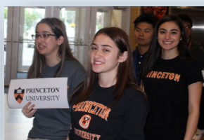
LED Seniors Commitment Parade