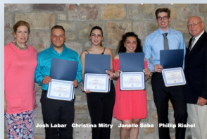
Alumni Associations School Spirit Scholarships