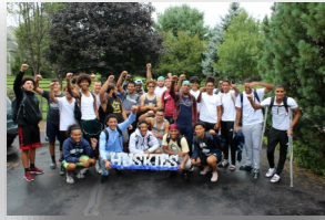
Football Team Swim Party