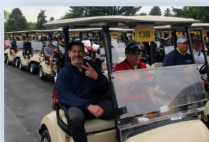
Football Golf Outing