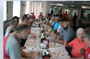
Annual Wrestling Reunion