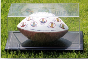
HOF Football Raffle