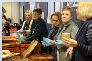
Key Club A Cappella Party